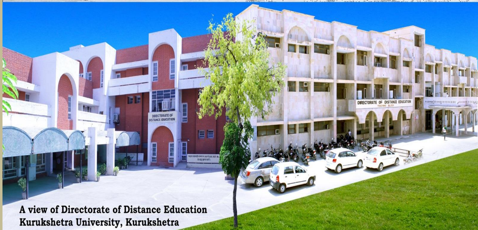
A view of Directorate of Distance Education Kurukshetra University, Kurukshetra